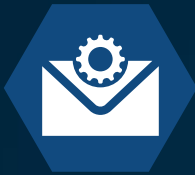
Advanced Email Automation