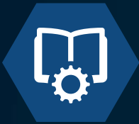
Dynamic Case Management

Unify Eccentex Low-Code and AI Capabilities with OpenText xECM Easily Connect Case Information To All Related Documents