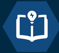
Smart Knowledge Base